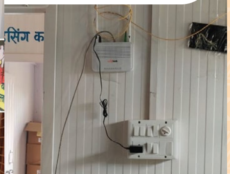
WiFi Installed at 2 HWCs, Chhattapur