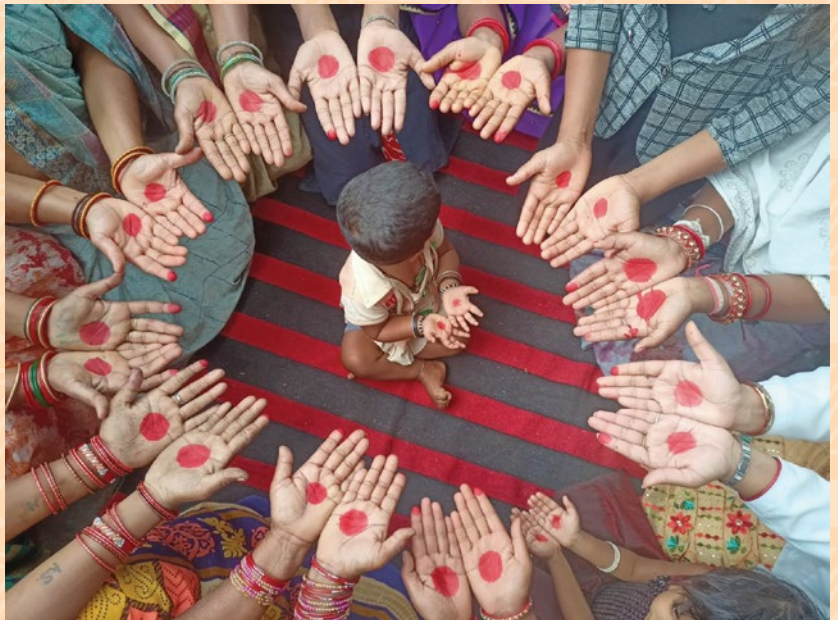
World Menstrual Hygiene Day Celebration, Shahdol

A 2 day celebration of World Menstrual Hygiene Day was observed in 22 districts. The CHO, ANM & ASHAs were pre-oriented on the agenda. ASHAs informed the community & schools about the celebration. It took an effort to celebrate the 2 days like a festival. The 1st day started with a health talk on menstrual hygiene for adolescents, families and teachers by the CHO. They highlighted the point of periods as a normal fact of life, access to sanitary products, safe, hygienic spaces in which to use them, and the right to manage menstruation without shame or stigma.