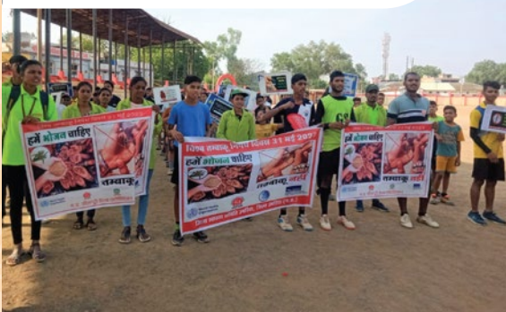
World No Tobacco Day Celebration, Umaria