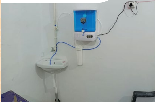
Water purifier installed at HWC Dehlan Choki, Panna district.