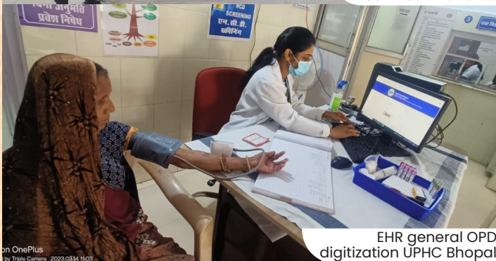
EHR general OPD digitization UPHC Bhopal