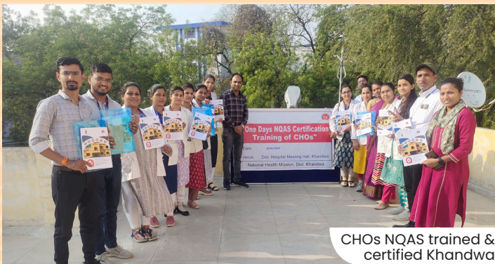
CHOs NQAS trained & certified Khandwa