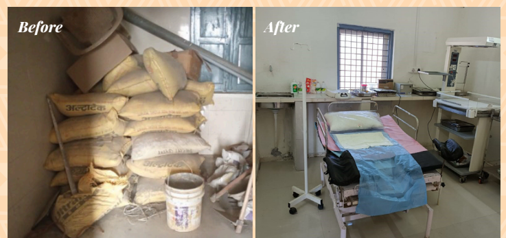
ANC room picture HWC Kali Talai

Access to quality maternity care is a challenge for pregnant women living in rural areas. Several gaps such as distant delivery points, poor awareness, and unaffordable care still need to be resolved completely.