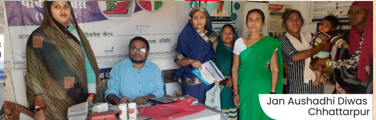
Jan Aushadhi Diwas Chhattarpur