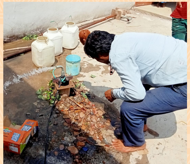
Installation of Water pump HWC Gadi Padariya

In India, the plethora of issues surrounding water points towards an existential resource crisis. Lack of water supply is a major challenge faced by every HWC. Gadi Padariya HWC, established in 2010, faced a continuous lack of water supply, causing discomfort to the staff and patients, especially during the summers. The issue was addressed by the CInI team leveraging the local support of various stakeholders at the block and district levels. As a result of the efforts a well was dug and a water pump was installed in the HWC. Gadi Padariya HWC is now the first facility in the district having 24*7 water supply within the premises.