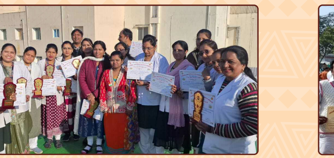
CHO & ANM awarded for achieving Kayakalp on 26th January