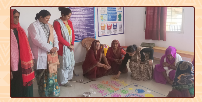
Mentoring done by the Peer CHO during the Kayakalp preparation, Sidhi

In the series of Peer Raising Peers, we have been capturing such efforts throughout the HWCs. The Community Health Officer from HWC Mau, Sidhi district played a role model by providing valuable insights, advice, and encouragement to other CHOs driving Kayakalp.