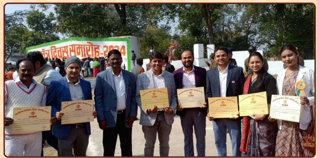
Appreciation to the CHOs and CInI team on 26th January