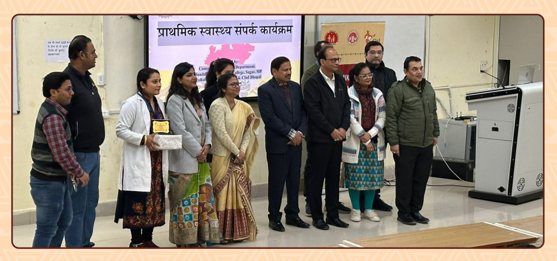
Prathmik Swasthya Sampark Karyakram at Sagar Medical College