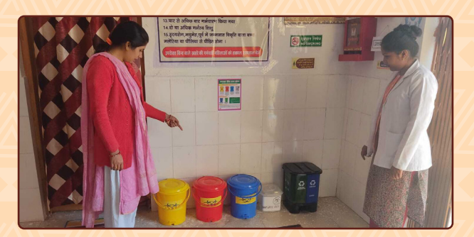
Kayakalp Preparation in the districts

Peer support is indeed a cornerstone of healthcare improvement. Mentorship skills, hands-on experience, and fostering connectivity among healthcare workers are critical elements in this process.