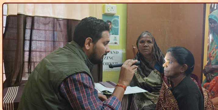
Screening and awareness on Universal Health Coverage day at the HWCs

Universal Health Coverage (UHC) means all people can access a full range of quality health services they need, when and where they need them, without financial issues.