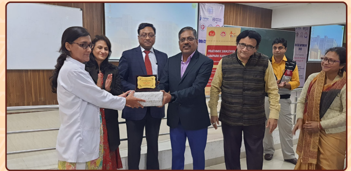
Recognition to the CHO in PSSK in Govt. Medical College of Vidisha