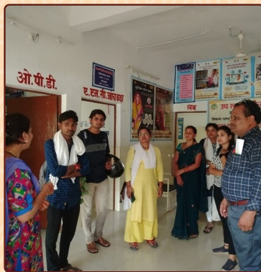
Peer CHO mentoring the other CHOs & ANM_ HWC Malachua, Umaria