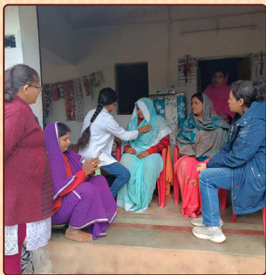
Series of home visit where CHO from Anuppur visiting the high risk pregnant women in the village