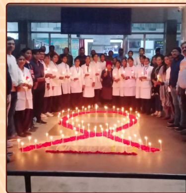
Observance of World Aids Day in the districts