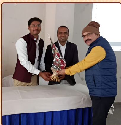
Ayushman Ambassador training completed in Khandwa