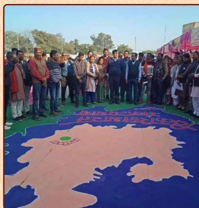
Viksit Bharat Sankalp Yatra in Umaria