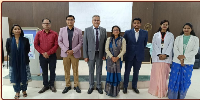
Prathmik Swasthya Sampark Karyakram in Govt. Medical college of Shahdol