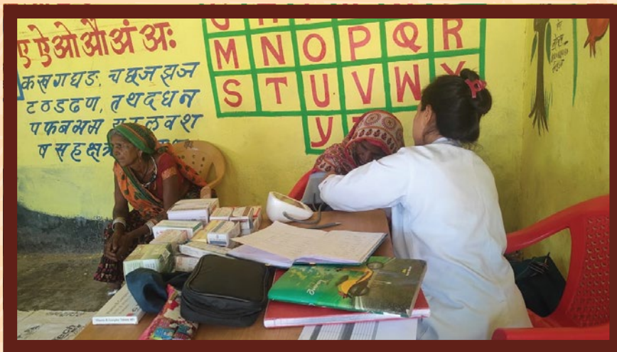
Ayushman Bharat HWC day celebration, Jhabua

The Ayushman Bharat (AB) HWC Day was observed in the intervention HWCs of 23 districts. On the fourth anniversary of the AB-HWCs, a themed activity "Mere Model ki Kahaani, Meri Zubaani" was organised by the CHOs and facilitated by the CInI team at their health and wellness centres. The activities were briefed a day before to the CHO & the staff, where they informed the ASHAs to call out the community for participation. General & NCD screening, counselling on the adaptation of oral health behaviours & drawing competitions were conducted in the school. Also, CHO and the staff spoke about the footfall and the importance of Model HWC, they spoke about their journey, hardships, and success and ended up taking a group selfie.