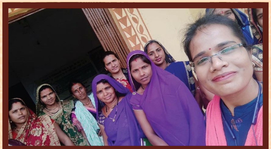
Mere Model ki kahaani, Meri Zubaani, Ayushman Bharat HWC day celebration at Sagar