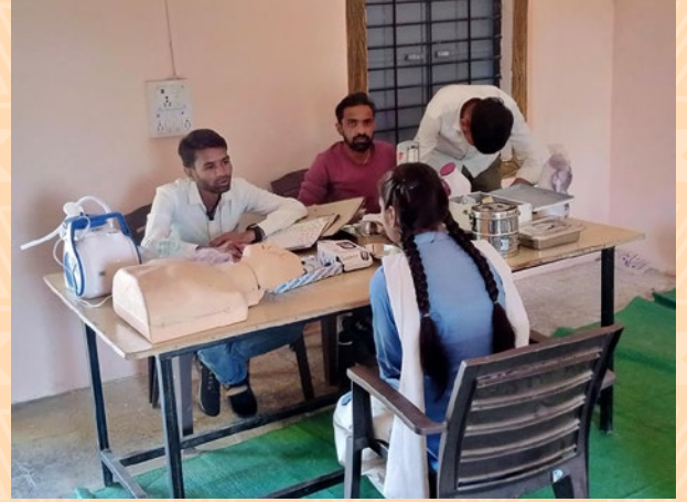
Ayushman Ambassador at their work, Khandwa

Under the Ayushman Bharat initiative, the ambassadors will work on health thematic areas; the role will suit the school teacher who actively participates in extracurricular activities such as community engagement, VHND, JAS & spreading awareness on health issues. In addition, as needed, they will initiate school-level health camps.