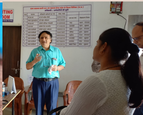
Re-arranging of drugs & counseling on Antara Inj. at HWCs